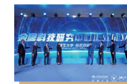
Zhejiang University-Ant Group Fintech Center