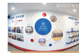
Zhejiang University Academy of Internet Finance