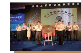
Zhejiang Association of FinTech