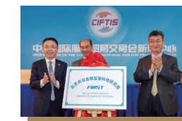
Frontier Institute of Regulation and Supervision Technology